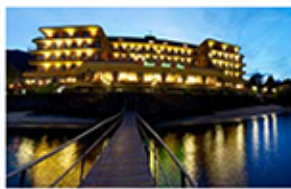
Zacchera Hotels Nights 4-6