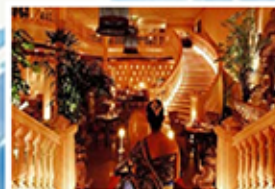
Hotel Astoria Lucerne Nights 8-9