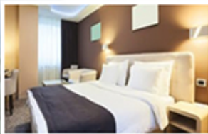
Hotel Krone Unterstrass Nights 1