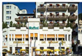
Hotel Steffani Night 7