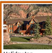
Holiday Inn Express/Springdale Zion Park Inn Nights 6-7