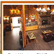
Best Western PLUS Bryce Canyon Grand Hotel Night 5