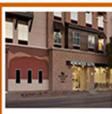
Homewood Suites by Hilton Moab Nights 3-4