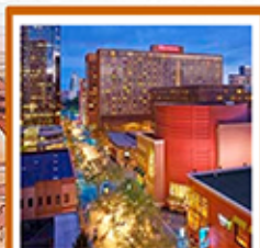
Sheraton Denver Downtown Hotel Night 1