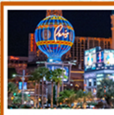
Paris Hotel Las Vegas Night 8