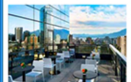
Sheraton Vancouver Wall Centre Nights 6-7