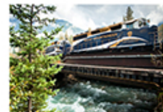
Rocky Mountaineer RailTours Night 5