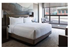
Calgary Marriott Downtown Night 1

Day: 8 Vancouver - Tour Ends- Breakfast Your adventure comes to a close today, leaving you with many memories of your extraordinary journey through the awe-inspiring Canadian Rockies.