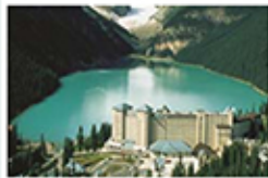
The Fairmont Chateau Lake Louise Night 2