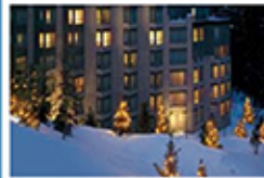
Rimrock Resort Nights 3-4